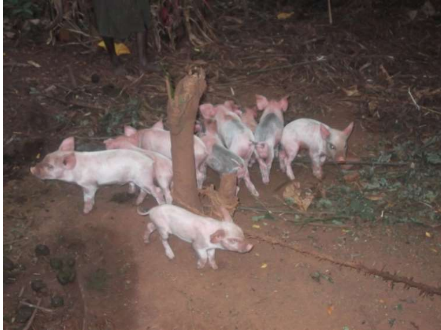
Piglets for one farmer, Ssanga village