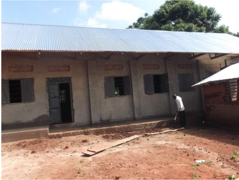
Buyomba Community Academy primary school's new 4 classroom building