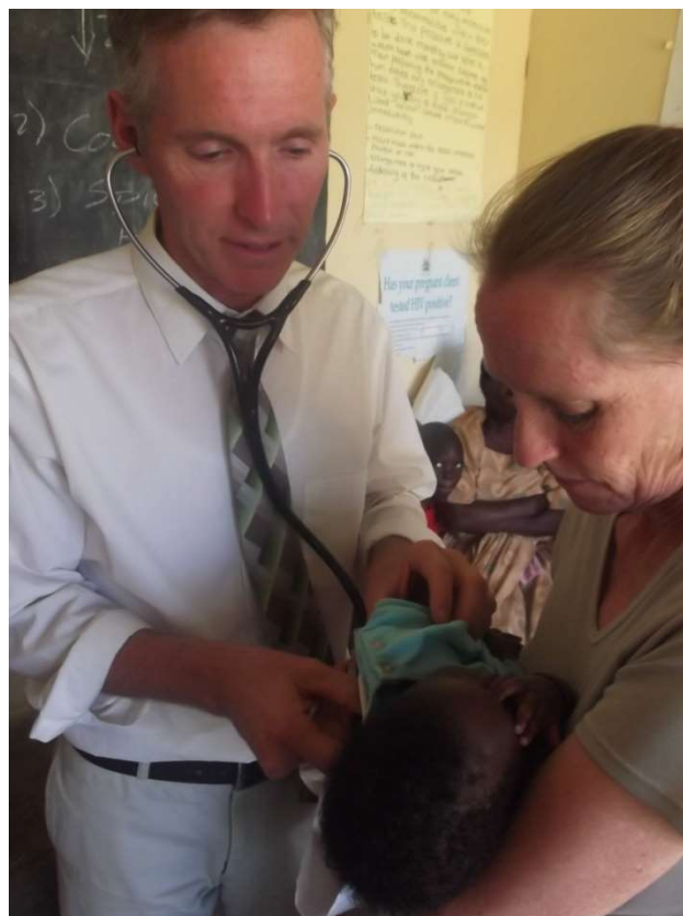
The Collins are checking a baby during the training.