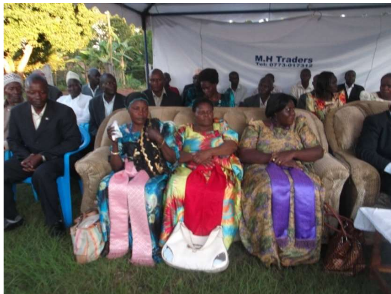
A community meeting