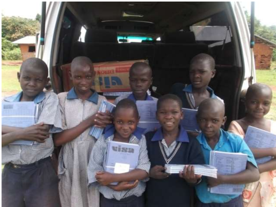
Buyomba Community Academy primary school with their exercise books