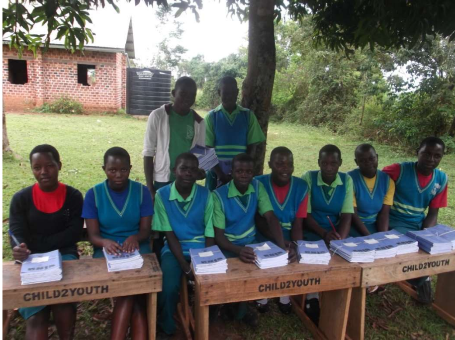
Royal Vocational Secondary school sponsored children with exercise books