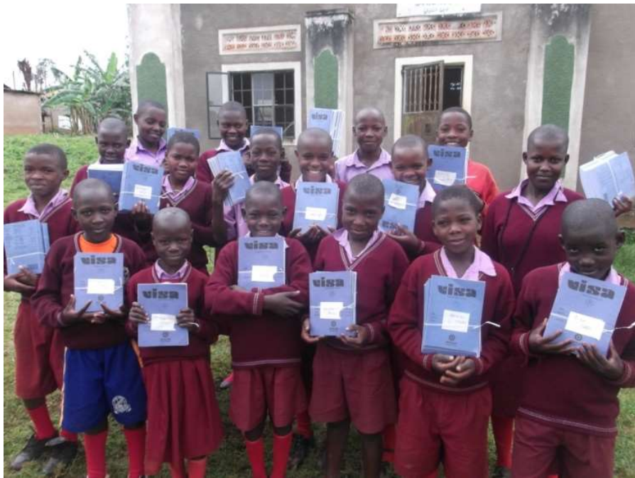
Brain Trust primary school, some of the sponsored children with exercise books