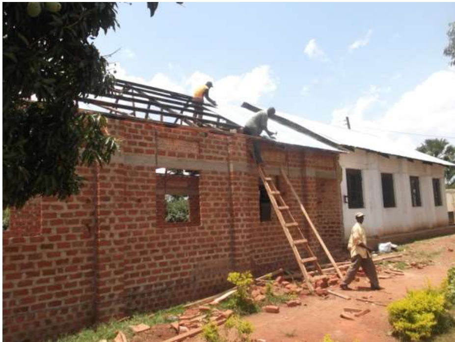
Liahona High School Boys Dormitory Expansion