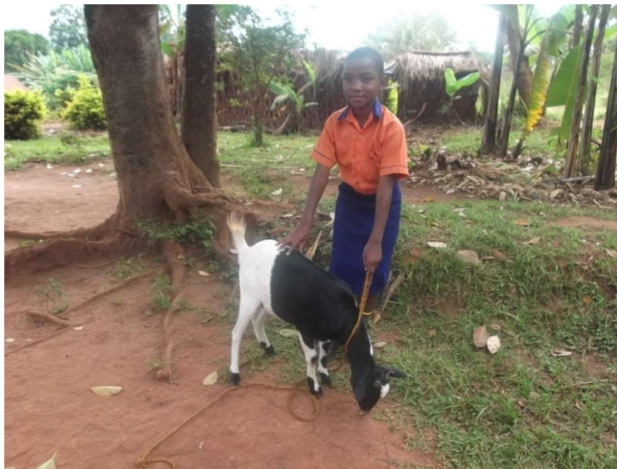
A sponsored girl with her goat.