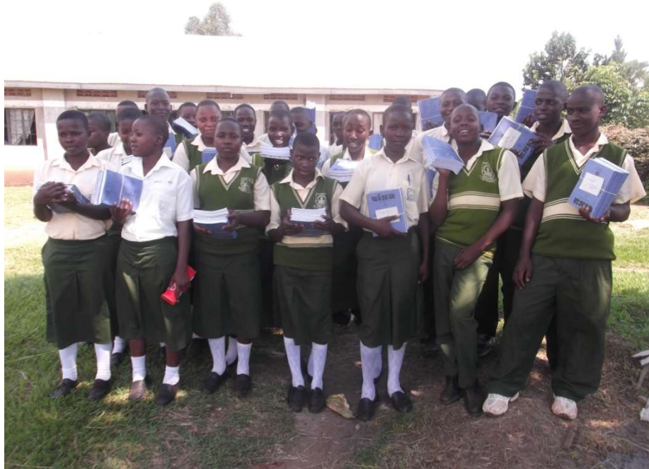
Liahona High School sponsored children with exercise books