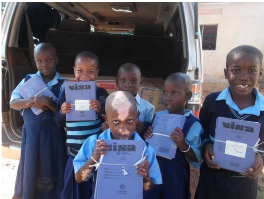
Part of God's Angel primary school sponsored children with exercise books