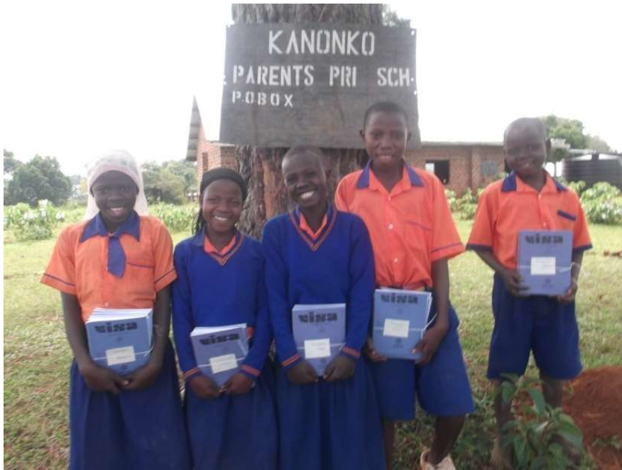
Kananko Parents primary school, some of the sponsored children with exercise books