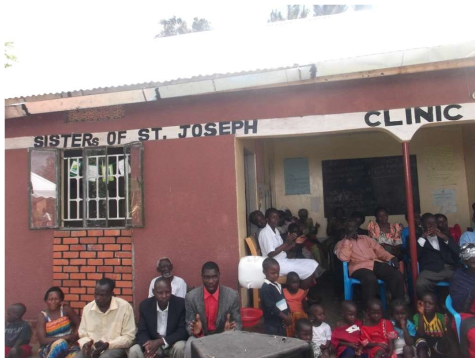
Community members attending the training at Sisters of St. Joseph Clinic, Kyambogo.