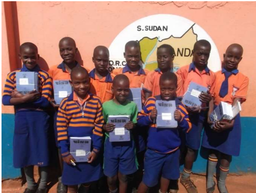
Little Angels primary school, some of the sponsored children with exercise books