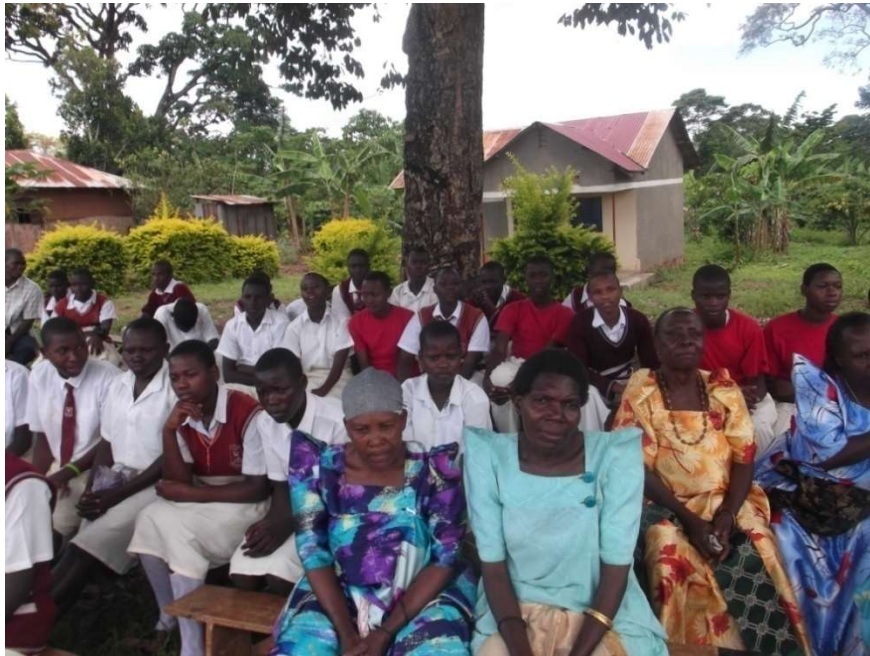
Attentive community members and students at one of the sensitization meetings

The Foundation team continued to conduct sensitization and consultation's meetings throughout the year with the school authorities, sponsored children and parents or guardians of sponsored children. Also such meetings were held with community projects leaders and members.