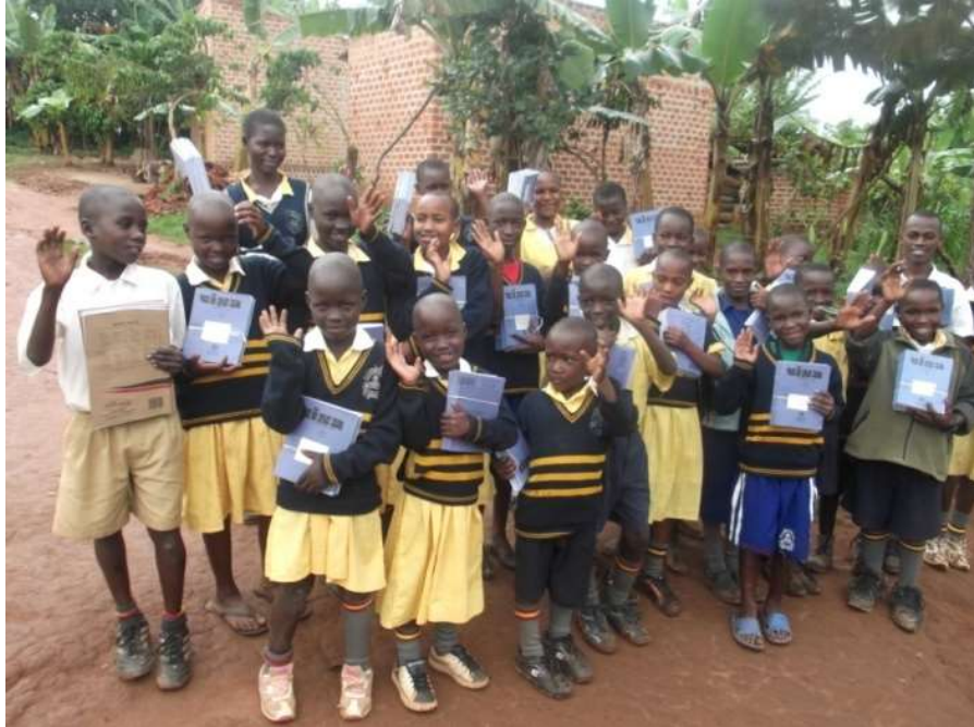
Lugasa Parents Primary school, some of the sponsored children with exercise books