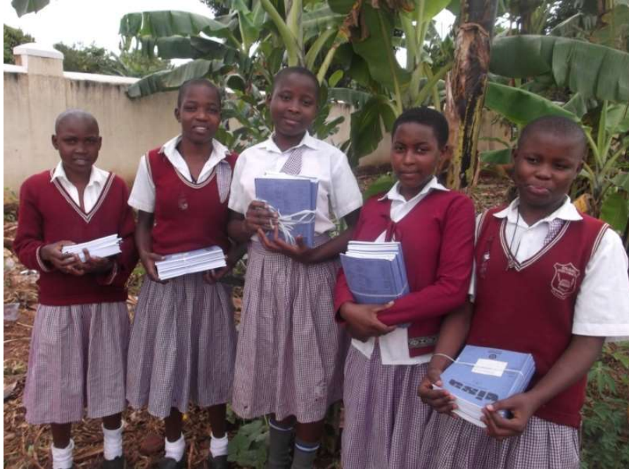
Gilgal Primary School, sponsored children with exercise books