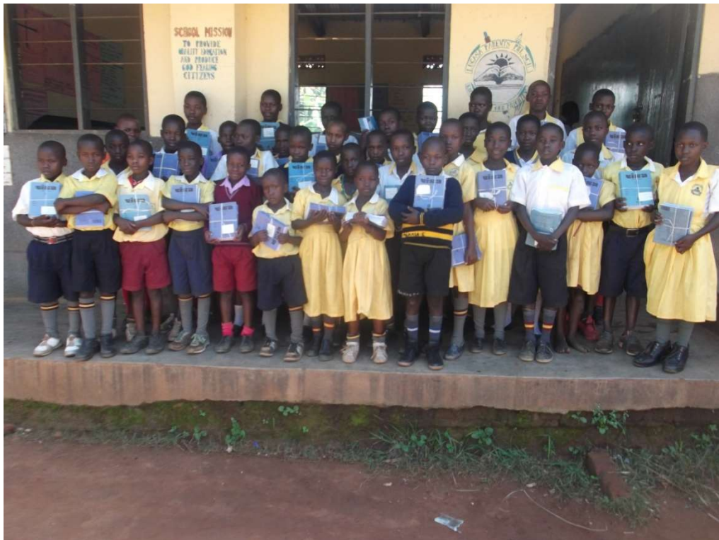
Lugasa Parents Primary School