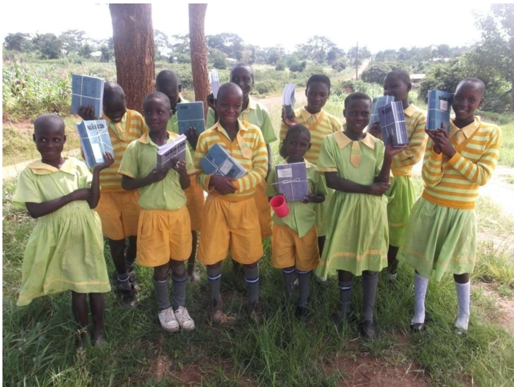
St. Francis Primary school