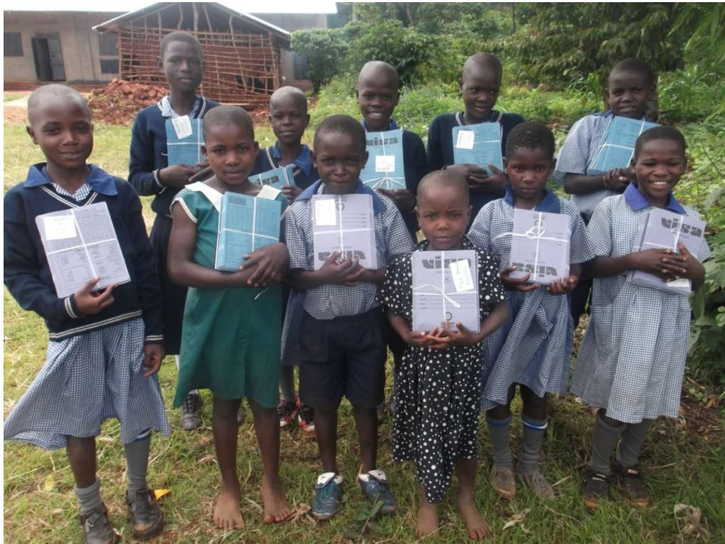
Buyomba Academy Community Primary school