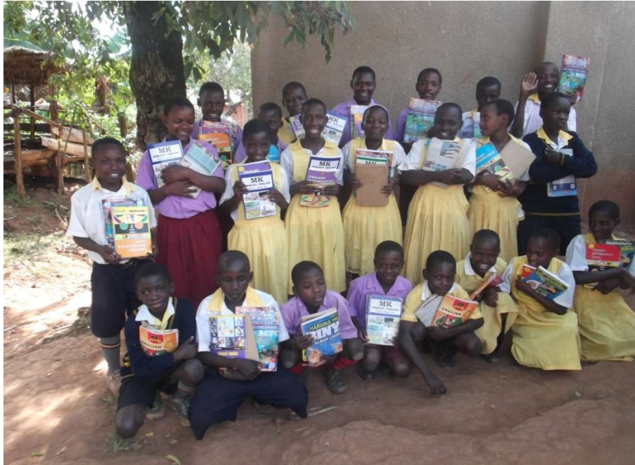
Sponsored children of Lugasa Parents P/SCH, pause for a photo after receiving their text books.