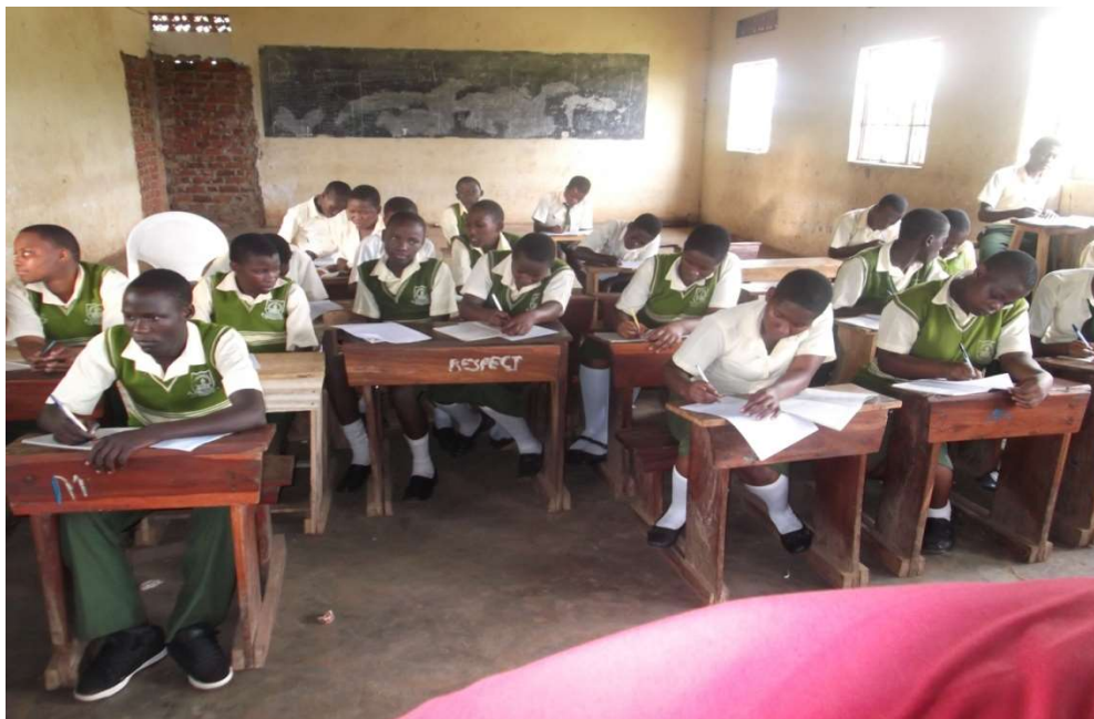
Sponsored students of Liahona High School writing thank you letters to their esteemed sponsors

Children have also written thank you letters to their sponsors thanking them the school fees and other scholastic materials as well as wishing them a merry Christmas and a happy new year as seen below;