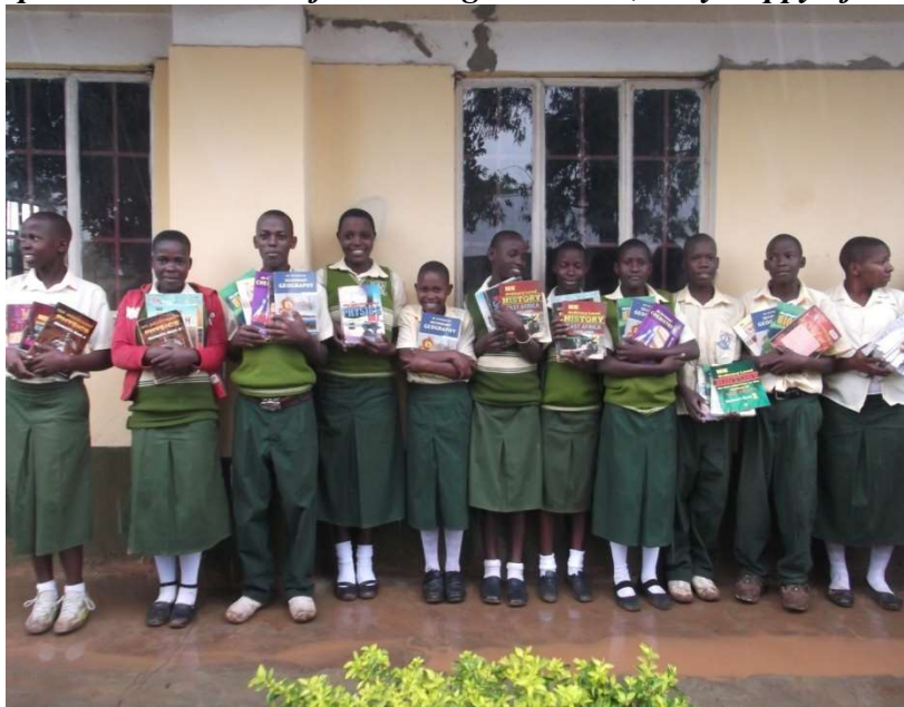
Sponsored students of Liahona High School also received their text books.