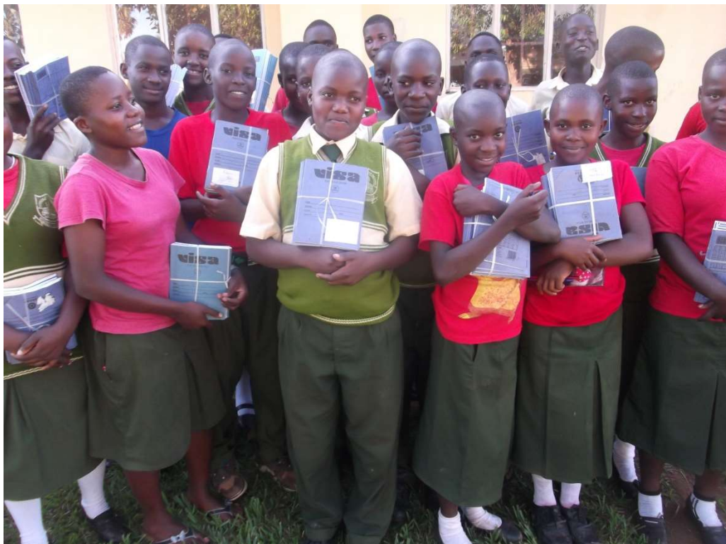
Liahona High School