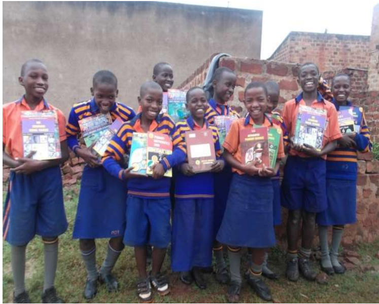
Sponsored children of Little Angels P/SCH, Very happy after receiving their text books.