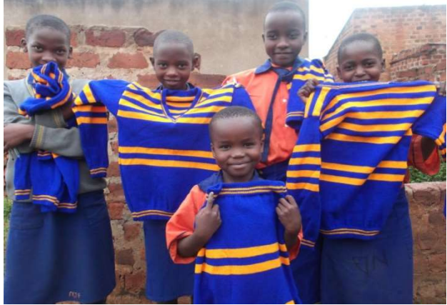
Sponsored children of Little Angels P/SCH, after receiving their school sweaters.

Children have also written thank you letters to their sponsors thanking them the school fees and other scholastic materials as well as wishing them a merry Christmas and a happy new year as seen below;