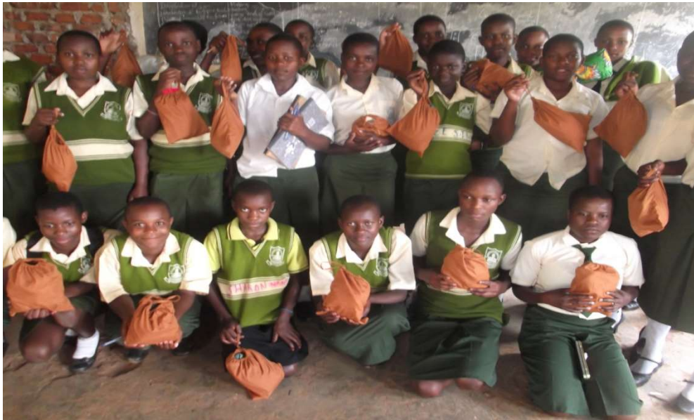
Sponsored children of Liahona High School with their Sanitary Pads

This programme is moving on well in a way that the group responsible is still trained especially on quality improvement and searching for the wider market of the sanitary pads. It should be noted that all the sponsored girls right from primary five (P.5) have been provided with the sanitary pads, just as seen in the photos below;