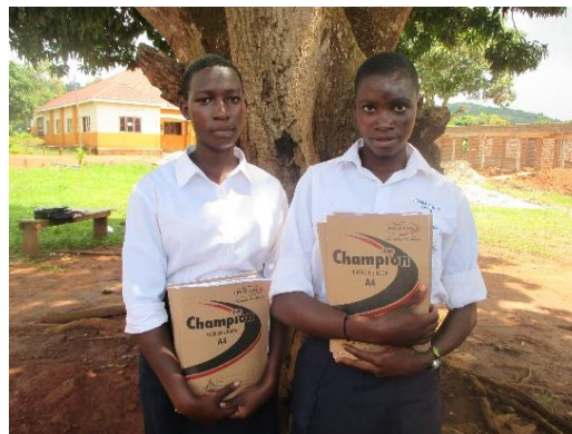
St. Stephen Sec. and Victoria View Sec. Schools