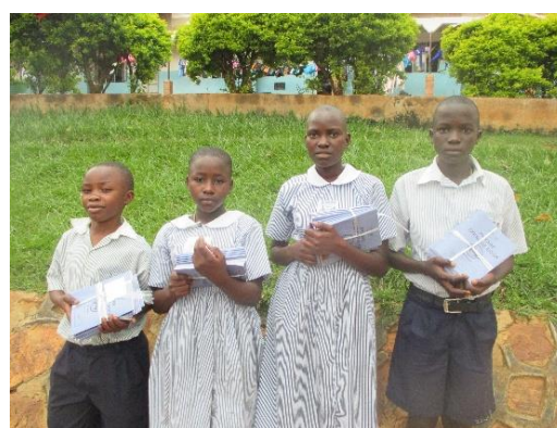
Little Angels Primary and Victors Junior Schools