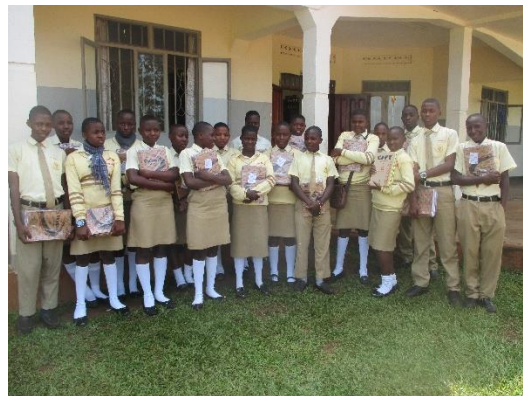
St. Josephs High School, Namagunga both A & O-level students