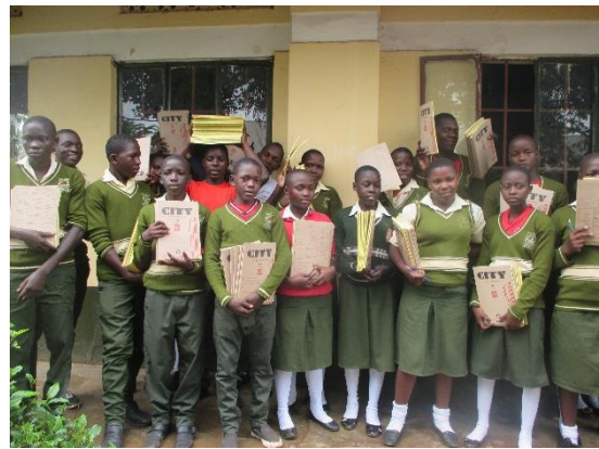
St. Lwanga Sec. and Liahona High Schools students