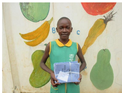
Bruhan Kikomeko c-f-1-028T and Banged Zam c-f-3-030C