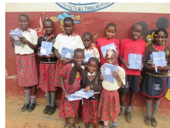
Buyomba Community Academy and God's Angel Primary schools