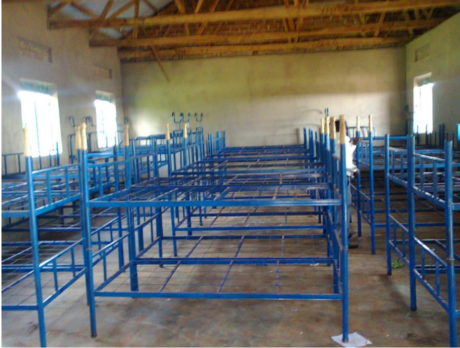
Beds in the newly constructed Girls Dormitory for Kanonko Parents Primary school