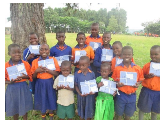
Lugasa Parents and Kanonko Primary Schools.