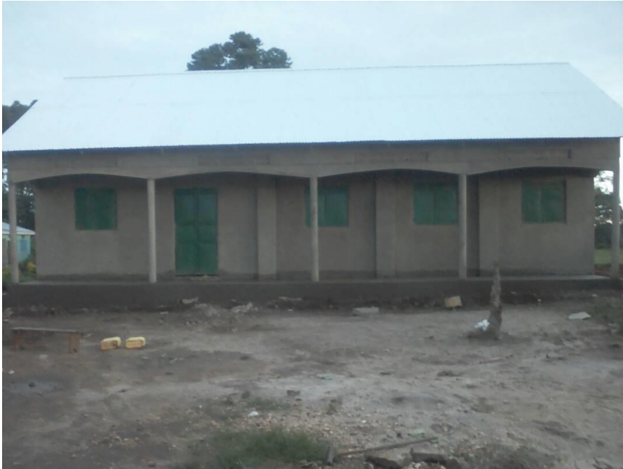
Front view of the girls' dormitory when undergoing constructions