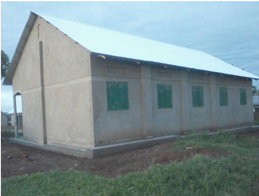
Behind view of the girls dormitory when undergoing constructions