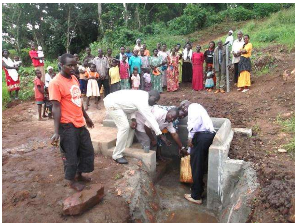
Some Kyanja Village members witnessing the water source handing over