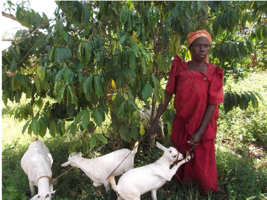
A lady with her nice looking goats