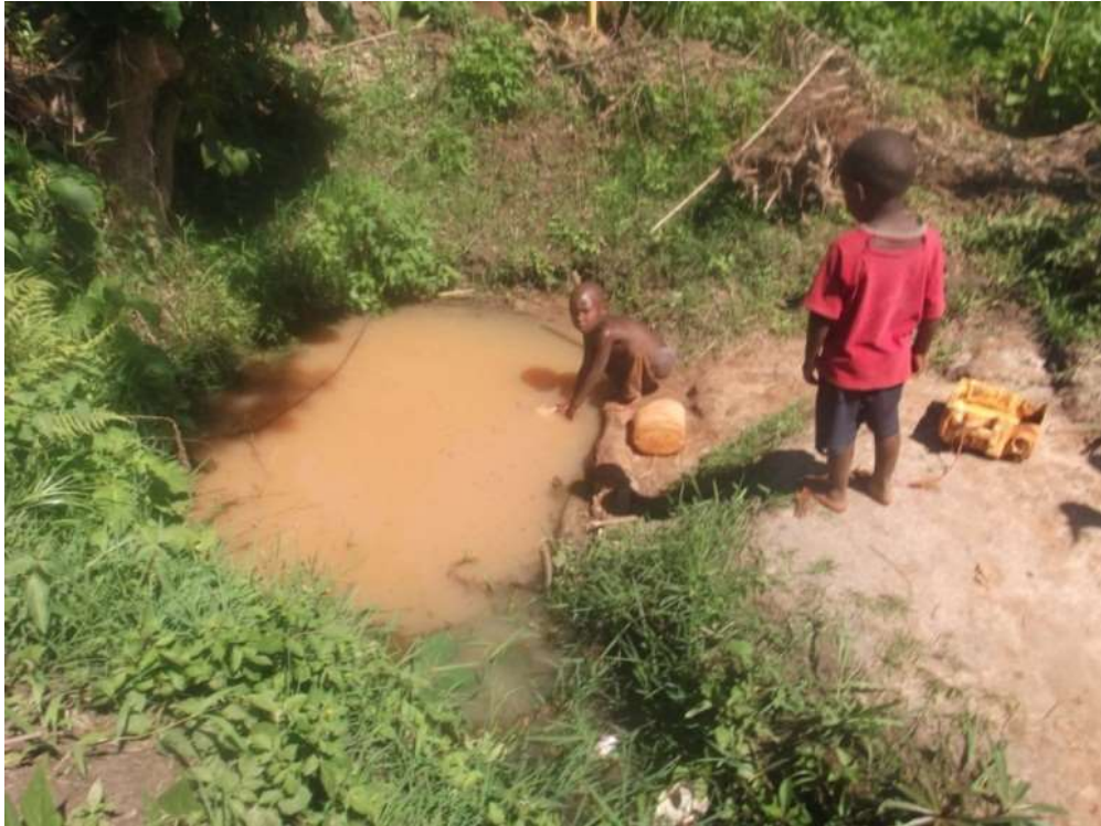
Ntikula village water source before its construction, children are fetching for domestic use