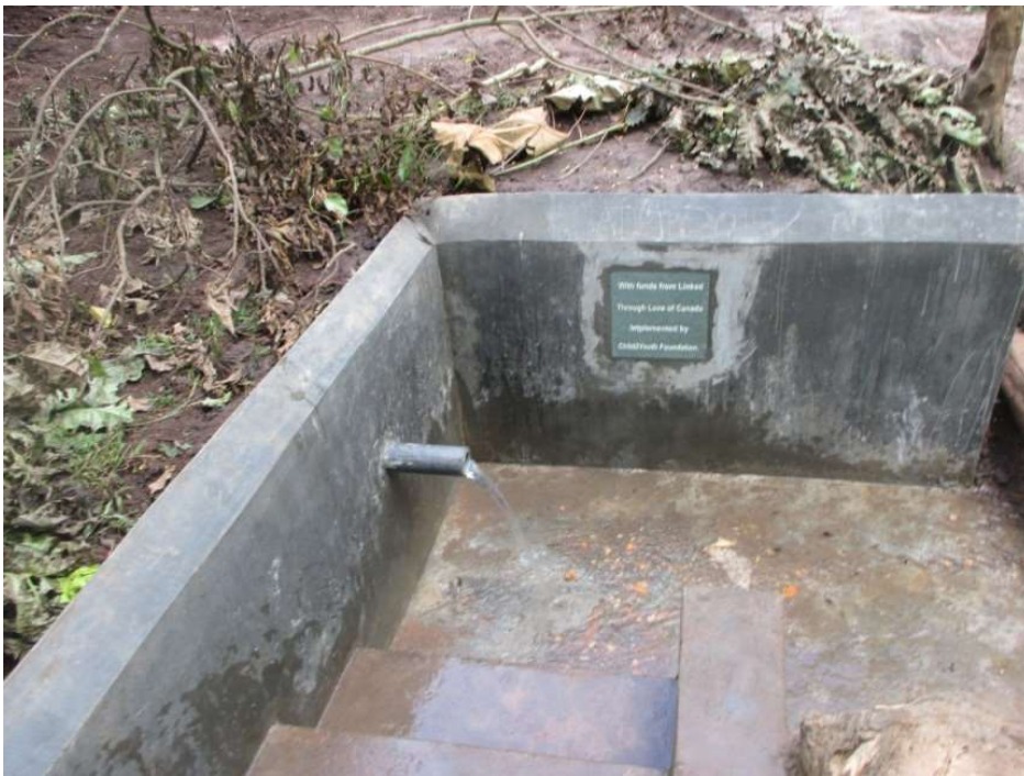
The constructed Lweru community water source