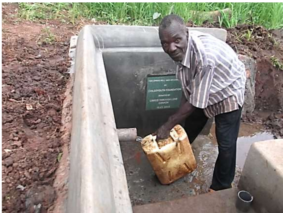
The constructed Kyanja community water source