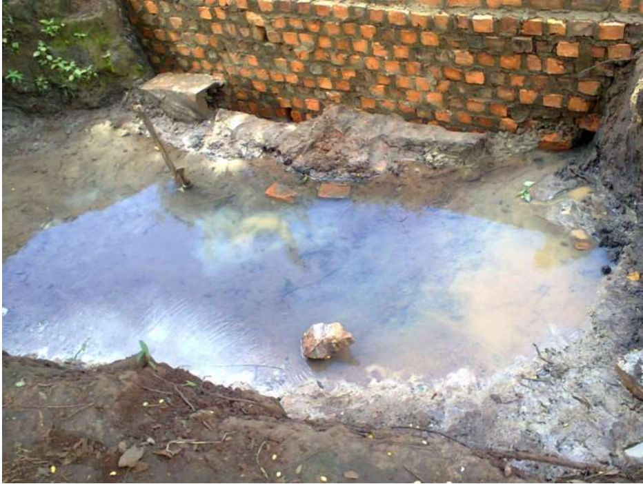
Original water source for Lweru Community before its protection/construction.