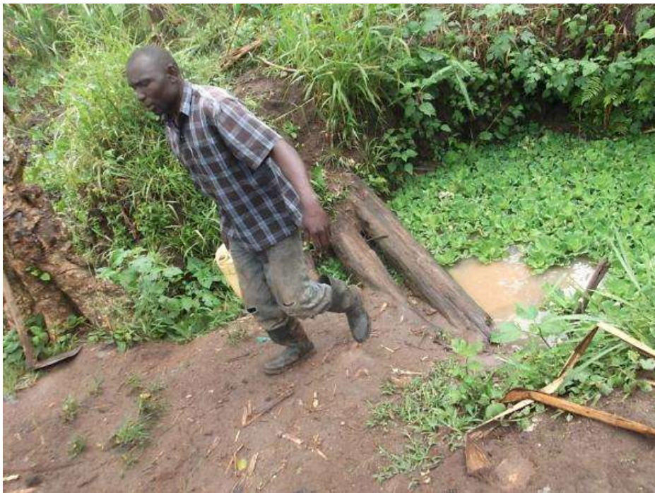
Kyanja community water source before its construction.