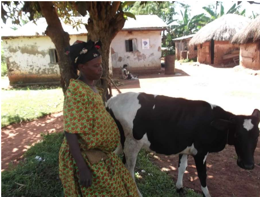
A lady happily looks at her cow