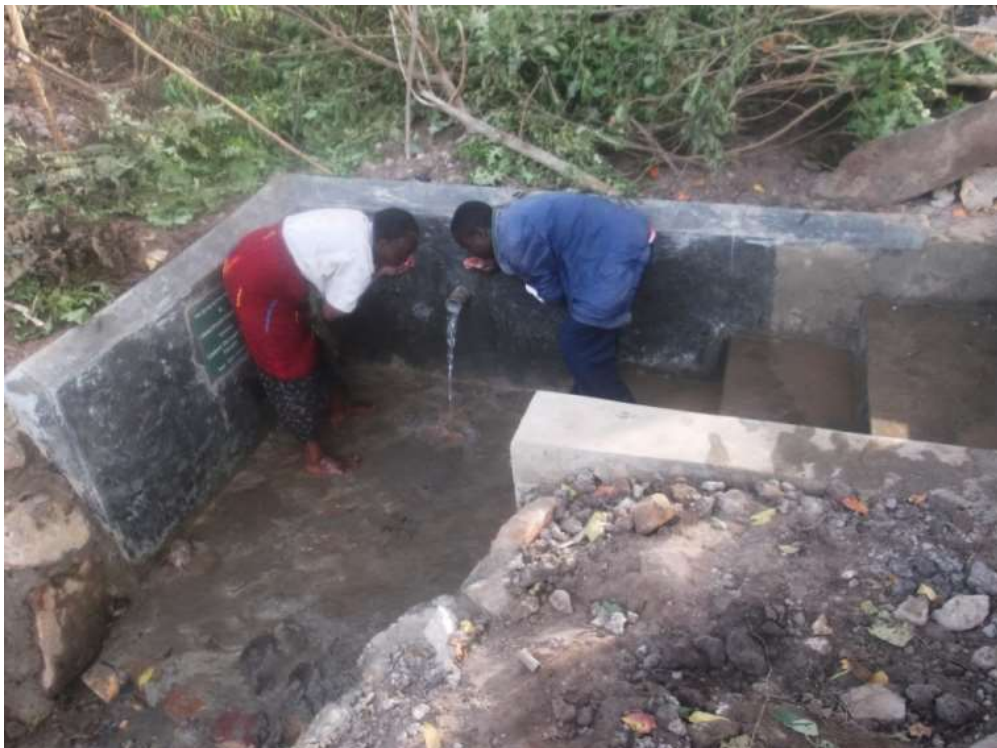
Constructed Ntikula Village Water Source, clean water.