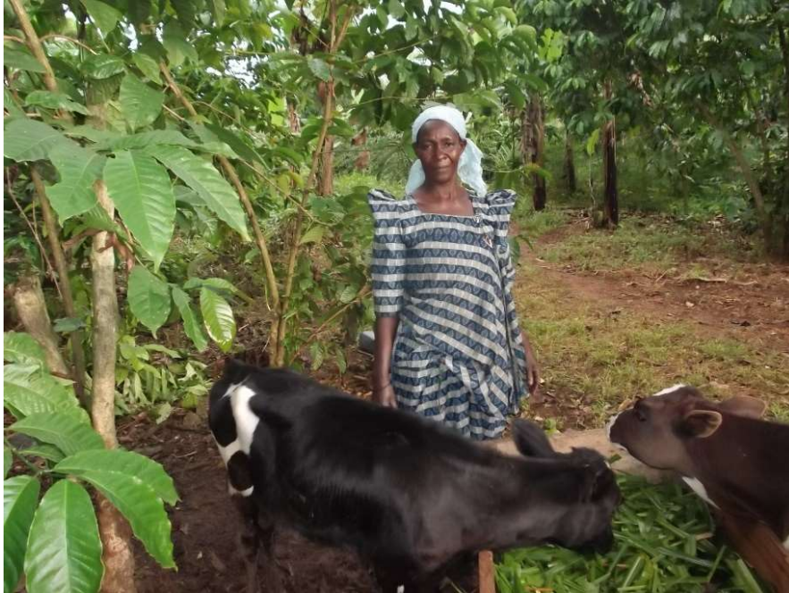
A lady feeding her calves given through Send a Cow program.