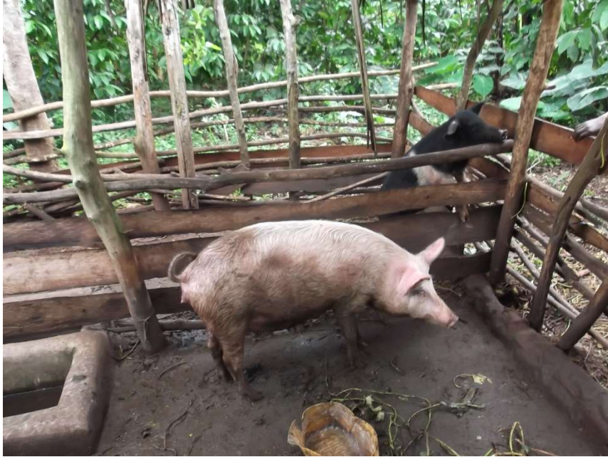
A piggy unit