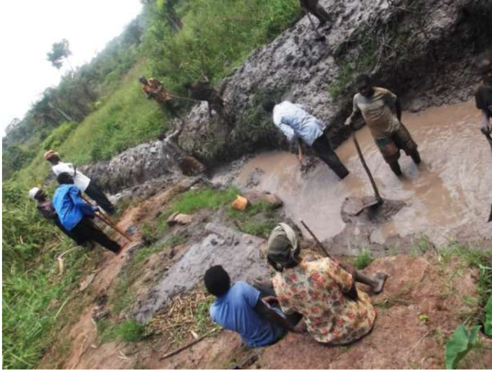
People of Kisimba village cleaning the trench for water flowing in preparation for construction